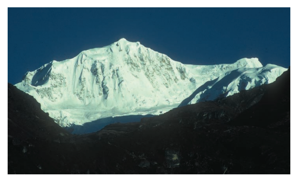
172. Kabru South and Kabru North taken from Dzongri Alm.

other high peak there which he could have ascended from his starting point except Kanchenjunga itself.'